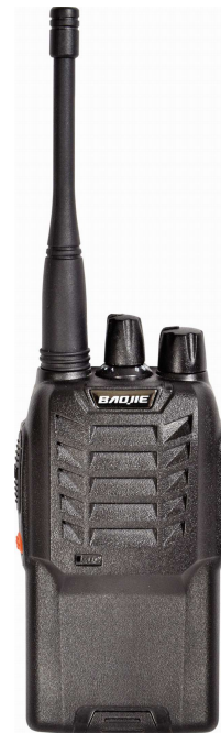
Picture of a handheld transceiver walkie-talkie